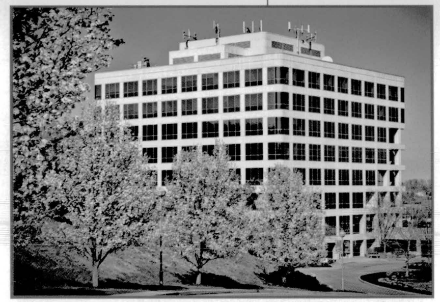
Ample and free covered parking are among the amenities offered by the 5700 Corporate Drive building where the new TMS headquarters is located. Because the headquarters complex takes up most of the space on the 7th floor, many of its windows offer exceptional views of the rolling landscape that surrounds the area.