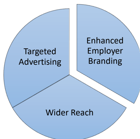
Figure 1: Influence of Social Media on Recruitment