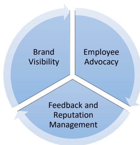
Figure 3: Influence of Social Media on Employer Branding