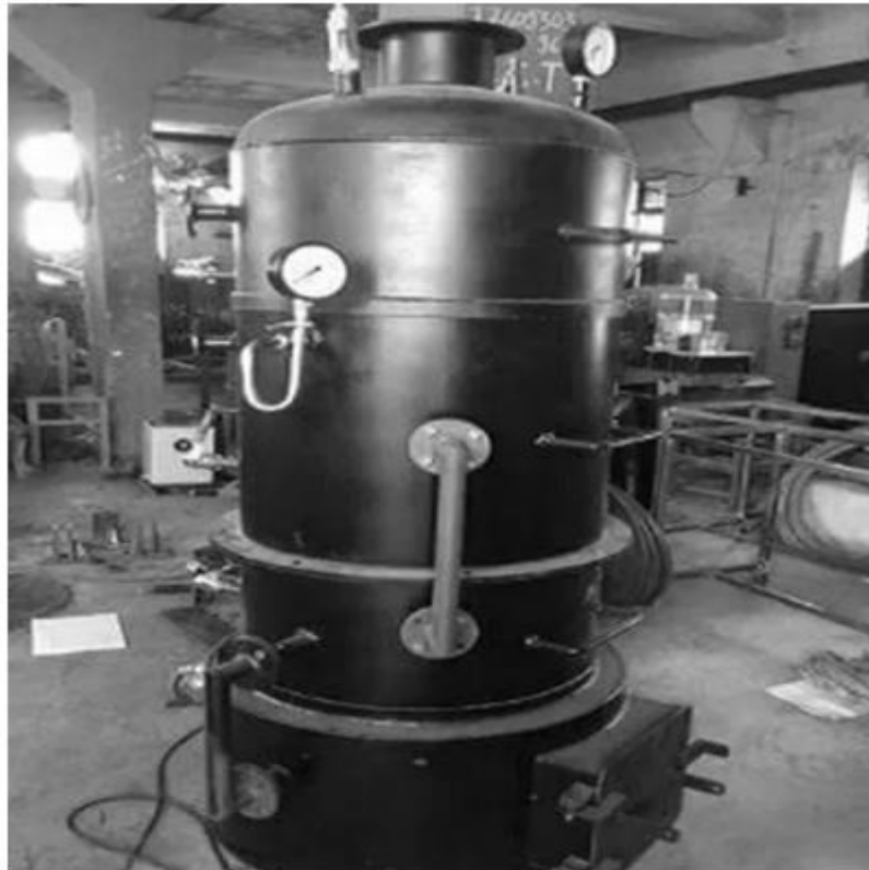
Figure 1. Boiler used in this research