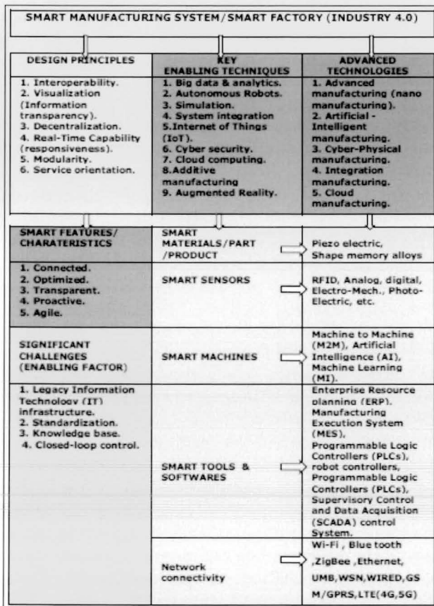
Fig. 2. Overview of smart manufacturing system towards industry 4.0.

5) Service-Orientation: Production must be customer-oriented. People and smart objects/ devices must be able to connect efficiently through the Internet of Services to create products based on the customer’s specifications. Today, manufacturing industries outsource some of their services, focusing on their core businesses, the idea that manufacturing industries will shift from selling products to selling and services. By this concept Manufacturing industries are becoming service providers as their products