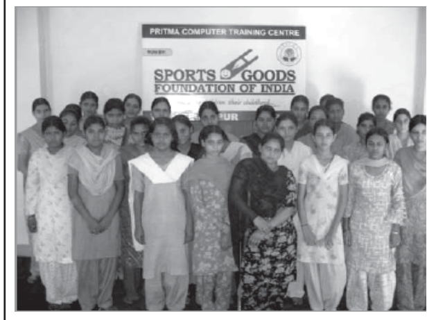
Figure 5. Free Computer Education

(7) Micro Insurance in Partnership with LIC : Sports Goods Foundation of India has partnered with LIC to promote its micro insurance scheme : 'Jeevan Madhur' among its household workers with an objective to cover 15,000 workers. This insurance scheme is a socioeconomic security for the workers (see Figure 4).