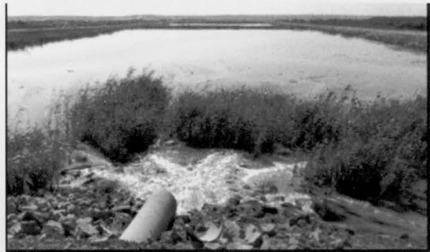
Fig. 2. Out put wastewater treatment