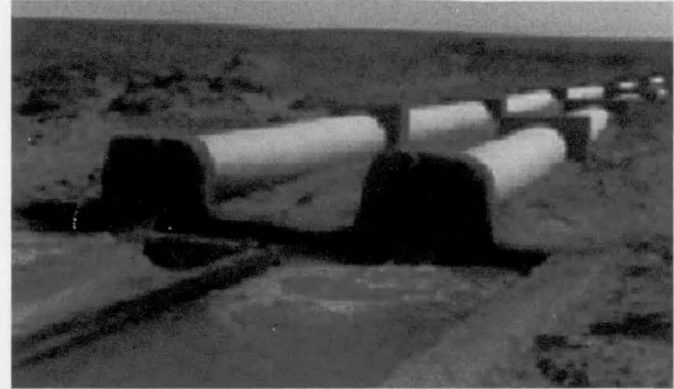
Fig. 1. Input of wastewater treatment plant

Demands for fresh water are increasing every year from 4% to 5% while the natural resources remain invariable if not decreasing, due to pollution because of the infiltration of waste water. We have