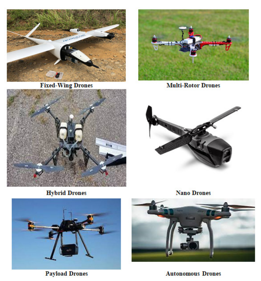
Figure 1. Types of Drones Used in construction Sites

The selection of a drone relies upon the wishes of the development mission. Each sort of drone has benefits and downsides of its very own. Through appropriate drone choice and utilization, production groups can optimize productiveness, augment protection, and curtail costs in their operations. After they used drones for his or her production initiatives, the most unusual uses have been for taking development pictures, followed utilizing taking promotional movies, carrying out inspections, and enhancing site online control. (figure 2)