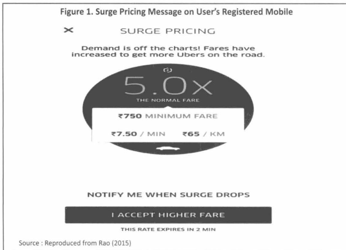
Figure 1. Surge Pricing Message on User's Registered Mobile

forecasting by Uber, which they do for every 15 minutes. As a result of this forecasting, the utilization rates of cabs increases to a dramatic extent, and as a result, the driver is able to make more number of trips per day. This is the reason why Uber doubles in size after every six months (Damodaran, 2014).